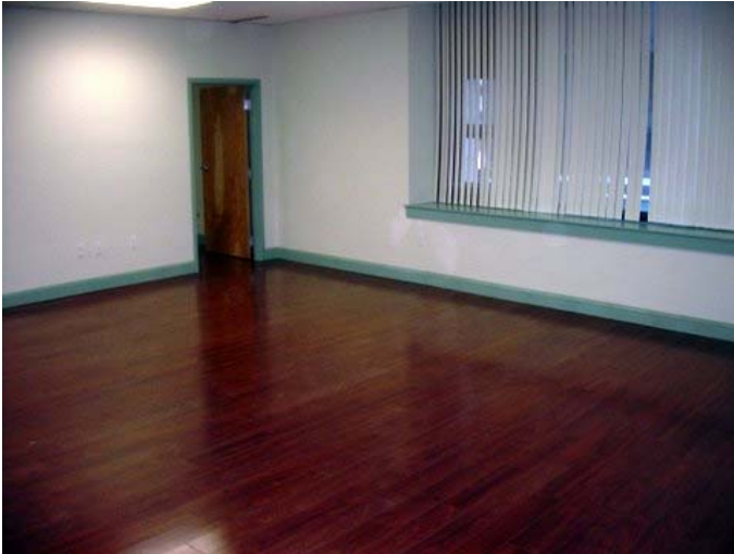
New onsite two-bedroom, four-person Model Apartment, where clients preparing for the transition into permanent housing can be trained in the adaptive living skills