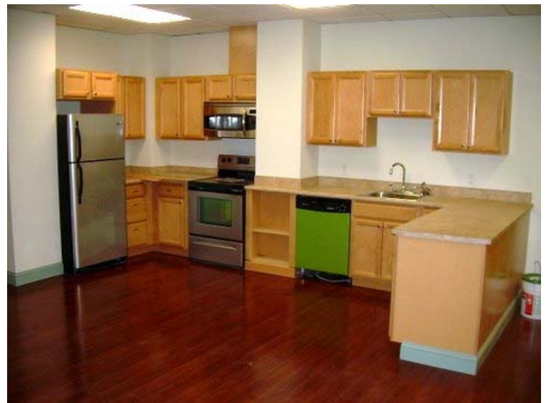
Newly renovated kitchenette within the apartment

Selection for suitable clients will be conducted by onsite clinicians and case managers, and they will move as a group of four into the model apartment for a three-month period of life-skills training. They will then move as a group into an apartment in the community, where they can continue to help and support one another, with the assistance of the Transitional Housing Program (THP) Housing Retention Specialist.